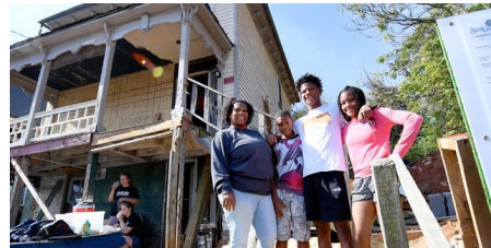
Habitat for Humanity