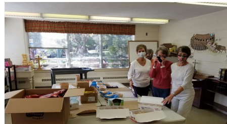
Trinity Lunch Program