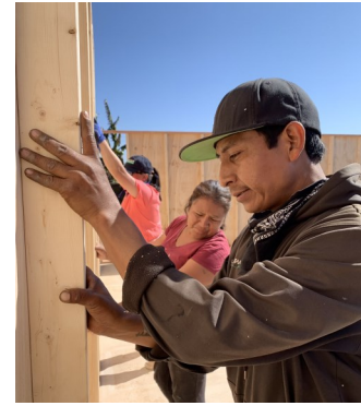
Baja Mission Trip