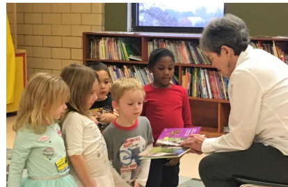
Boys & Girls Club